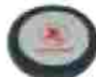
PERFECTION PAD EQ2003