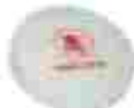
REVIVAL PAD EQ2002