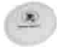
QUICK CUT PAD EQ2001